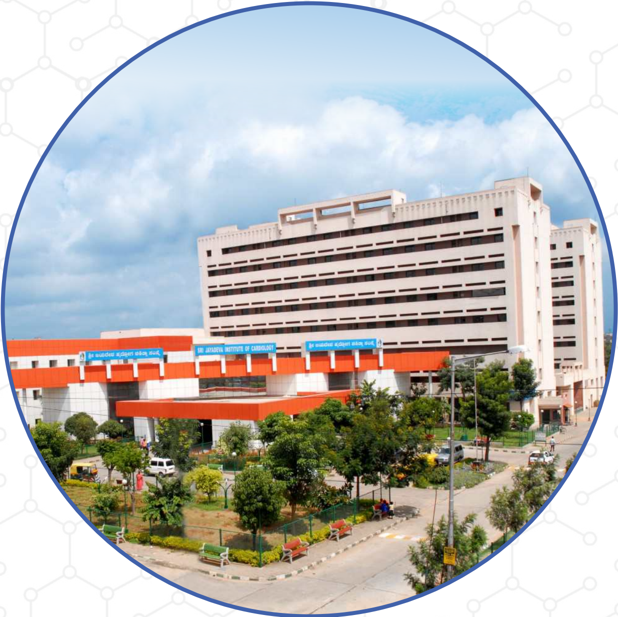
Sri Jayadeva Institute of Cardiovascular Sciences and Research